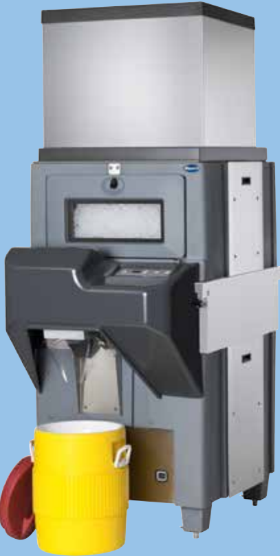
Ice Pro DB650 automatic dispensing bin