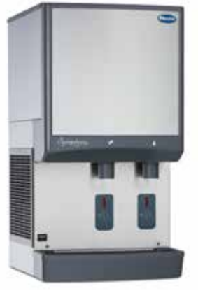
Symphony Plus<sup>™</sup> ice and water dispensers