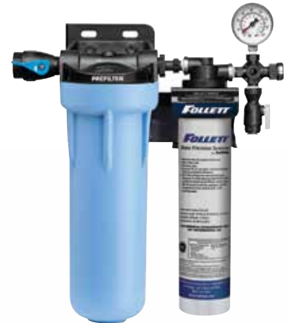
Carbon and carbonless water filter system

Available in standard (3,000 gallons) and high capacity (15,000 gallons), these filters provide multi-level filtration to remove chlorine, taste, odor, cysts, and 99.9% of all particles 0.5 micron and larger in size at low pressure drops across the filter. Scale inhibition protects the machine from scale damage, reducing energy and service costs.