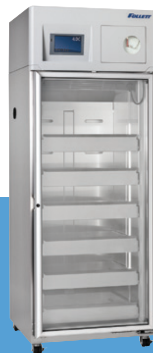
Blood bank refrigerator