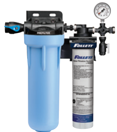
Carbon and carbonless water filter system

Available in standard (3,000 gallons) and high capacity (15,000 gallons), these filters provide multi-level filtration to remove chlorine, taste, odor, cysts, and 99.9% of all particles 0.5 micron and larger in size at low pressure drops across the filter. Scale inhibition protects the machine from scale damage, reducing energy and service costs.