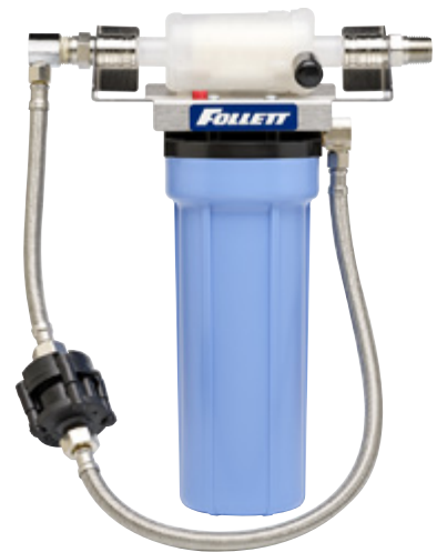
Bacterial-retentive filter system

The only bacterial-retentive filter system recommended for use with Follett ice and water dispensers.