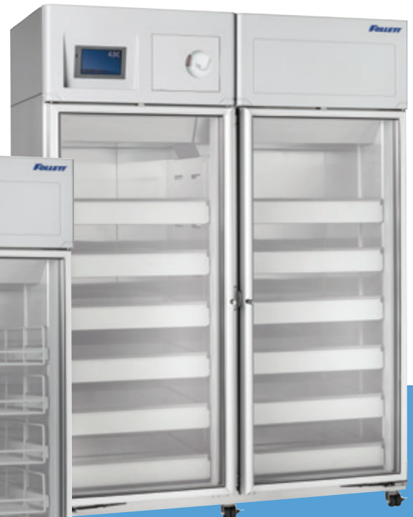
Blood bank refrigerator