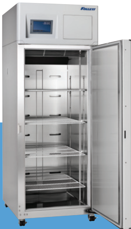
Lab and pharmacy freezer