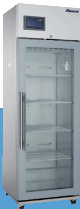
REF 12 refrigerator