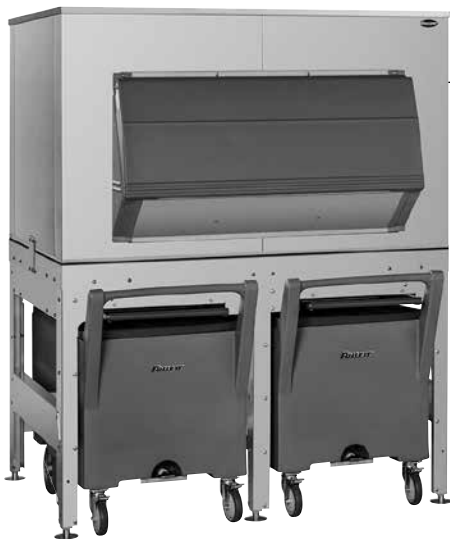
Gravity ice dispense eliminates scooping