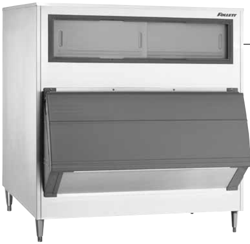
Model E-SG1300-49D shown