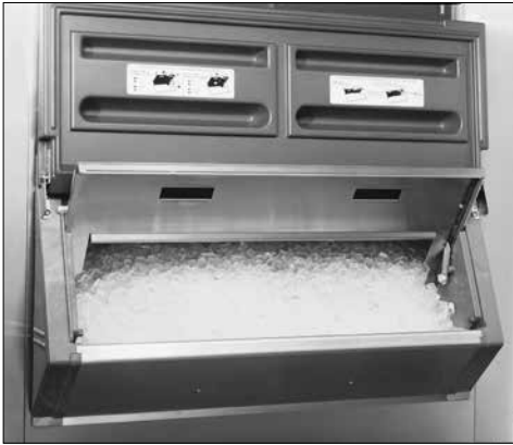
Industry exclusive SmartGATE ice shield