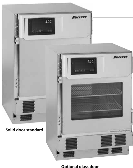
Solid door standard