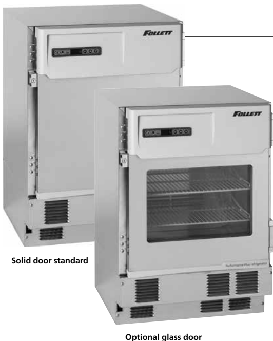
Solid door standard