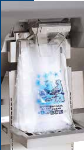
Bags are blown open