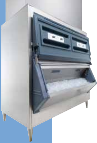
single door upright

A better bin design improves ice quality and reduces serious health and safety risks for your employees and customers. After all, ice is food and should be handled in a safe and sanitary manner.