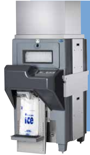
Ice Pro DB650