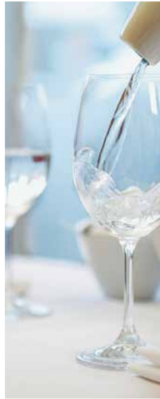
fresh ice turnover

Follett upright bins eliminate the need to bend into the bin. Scooping ice is cleaner and safer.