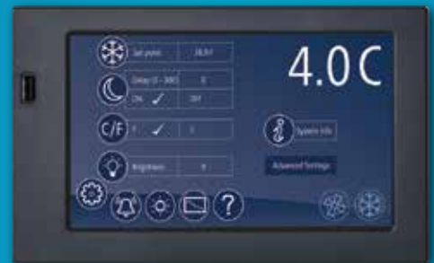
Quick access to control settings

Optional 7" full-color capacitive LCD touchscreen provides direct access and control to key settings