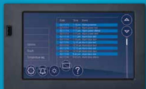
Event and data logging with easy downloading via convenient USB port