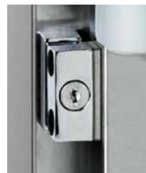
Universal ADC door bracket