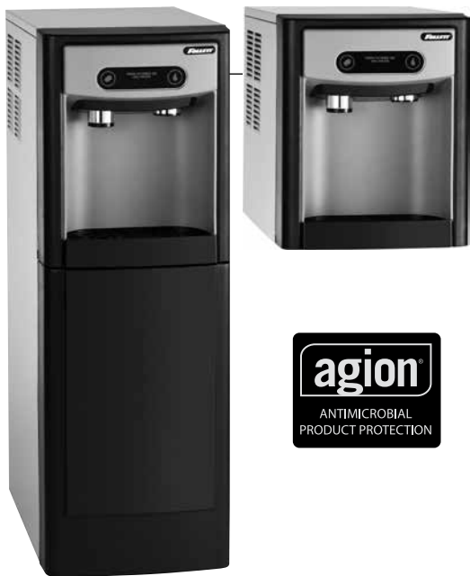
Shown with optional base stand

NOTE: For use in applications with greater than 5 mg/l but less than 400 mg/l total dissolved solids in water and less than 200 mg/l hardness (either naturally occurring or treated with reverse osmosis or other TDS reducing technology). Not recommended for use with softened water.