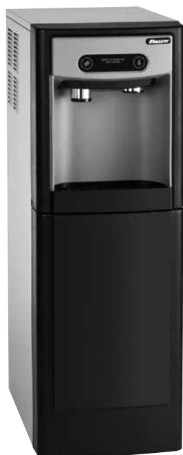
Shown with optional base stand