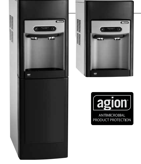
Shown with optional base stand

NOTE: For use in applications with greater than 5 mg/l but less than 400 mg/l total dissolved solids in water and less than 200 mg/l hardness (either naturally occurring or treated with reverse osmosis or other TDS reducing technology).