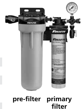
pre-filter primary filter