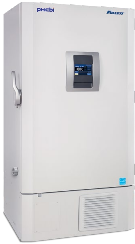
MDF-DU702VH-PA | FZR26-ULT-220