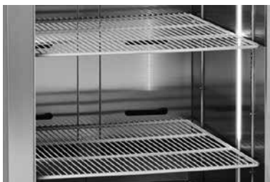
Heavy-duty epoxy coated shelves on LB models