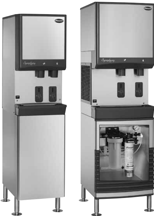
Standard base stand. Dispenser model 12CI425A shown.