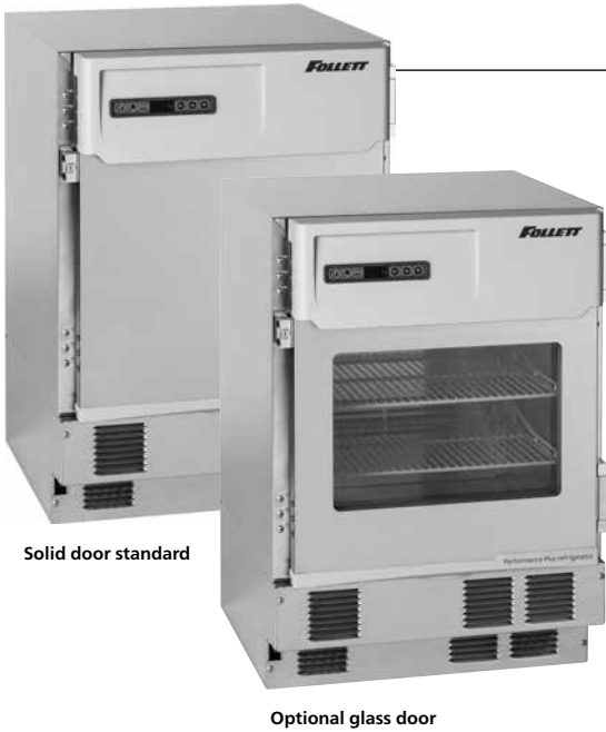
Solid door standard