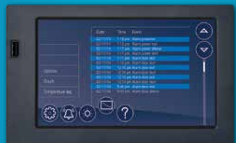
Event and data logging with easy downloading via convenient USB port