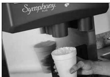
SensorSAFE not recommended for use with clear containers or for applications in direct sunlight