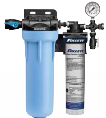
Carbon and carbonless water filter system

Agion is a registered trademark of Sciessent LLC. HORIZON ELITE, MAESTRO PLUS, MICRO CHEWBLET, SENSORSAFE, SYMPHONY PLUS and QUIET NIGHT are trademarks of Follett Products, LLC. CHEWBLET, FOLLETT and FOLLETT HEALTHCARE are registered trademarks of Follett Products, LLC, registered in the US. Follett reserves the right to change specifications at any time without obligation.