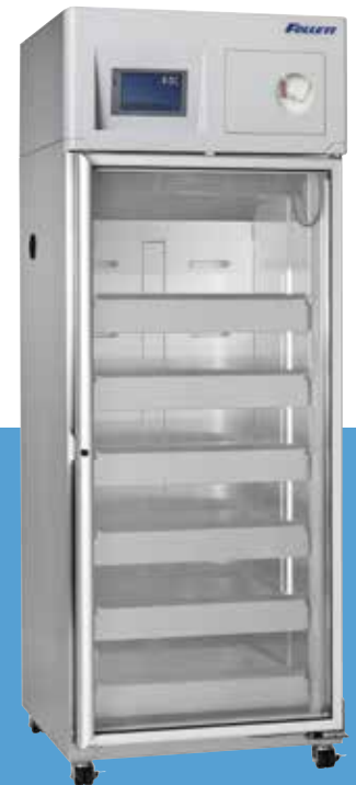
Blood bank refrigerator