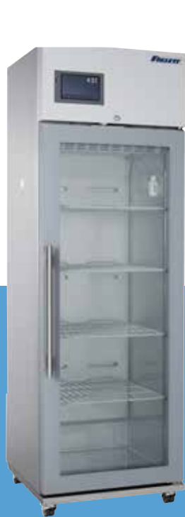
REF 12 refrigerator