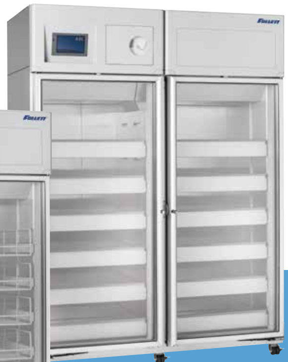
Blood bank refrigerator