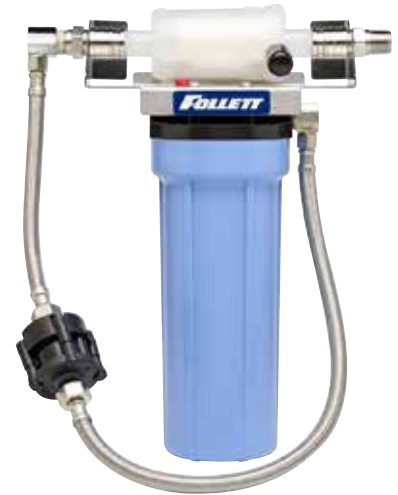
Bacterial-retentive filter system

Follett's industry-first pressurized water sanitizing kits sanitize the internal pressurized water lines of the ice and water dispenser. The procedure facilitates a complete sanitization of the entire ice and water dispenser when performed in conjunction with the standard ice machine and dispenser cleaning/sanitizing process.