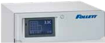
7" LCD touchscreen with optional keypad