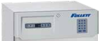
LED controls with optional keypad