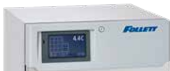
7" LCD touchscreen with optional keypad