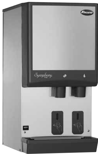
Shown with SensorSAFE™