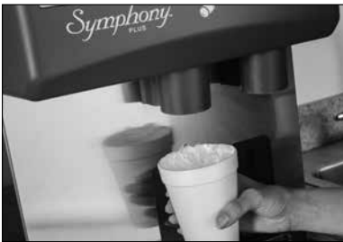
SensorSAFE not recommended for use with clear containers or for applications in direct sunlight