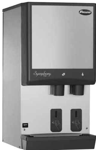
Shown with SensorSAFE™