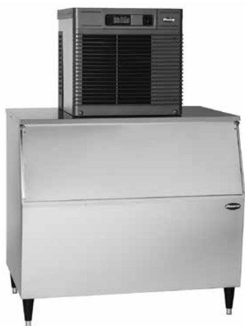
Model MCD425ABT shown

† Consumer study conducted by independent agency Roper ASW.