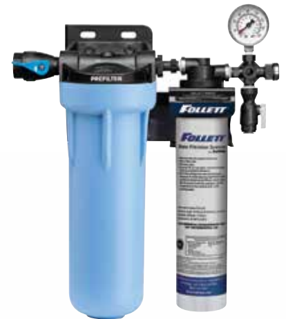
Carbon and carbonless water filter system

Agion is a registered trademark of Sciessent LLC. Horizon Elite, Maestro Plus, Micro Chewblet, SensorSAFE, Symphony Plus and Quiet Night are trademarks of Follett LLC. Chewblet and Follett are registered trademarks of Follett LLC, registered in the US. Follett reserves the right to change specifications at any time without obligation.