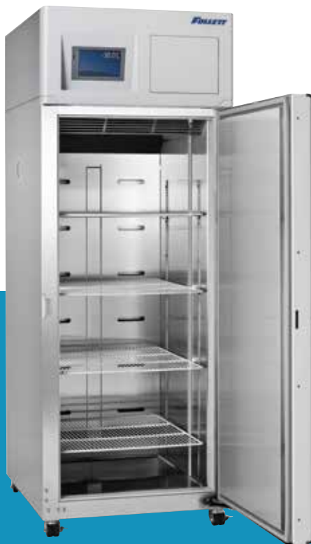
Lab and pharmacy freezer