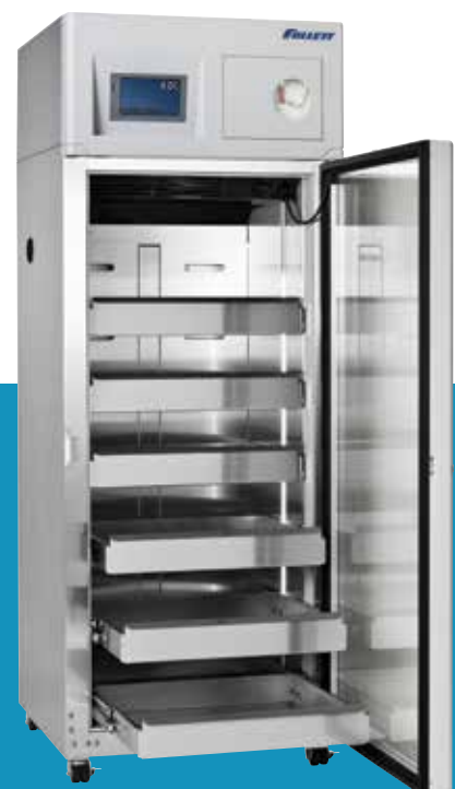
Blood bank refrigerator