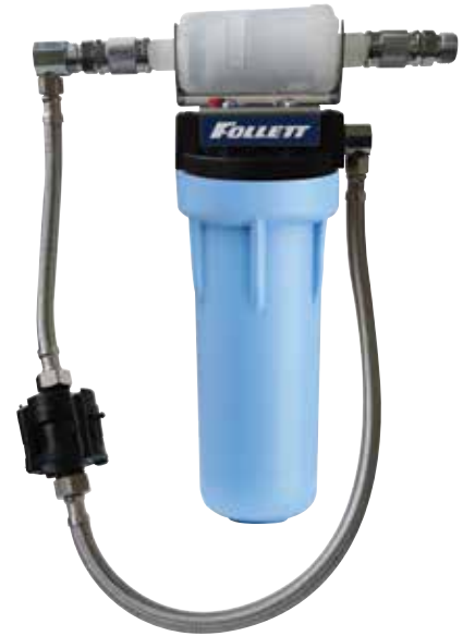
Bacterial-retentive in-line water filter system

Follett's industry-first pressurized water sanitizing kits sanitize the internal pressurized water lines of the ice and water dispenser. The procedure facilitates a complete sanitization of the entire ice and water dispenser when performed in conjunction with the standard ice machine and dispenser cleaning/sanitizing process.