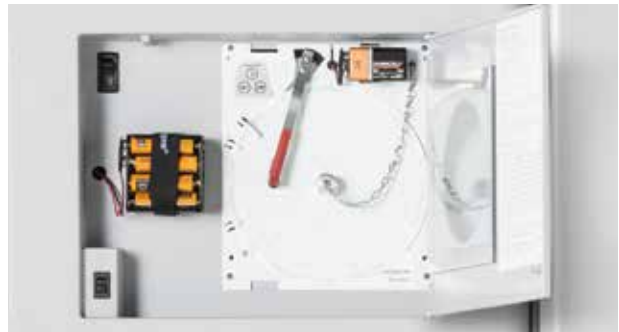
Analog chart recorder standard on Blood Bank and Plasma models