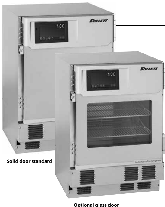
Solid door standard