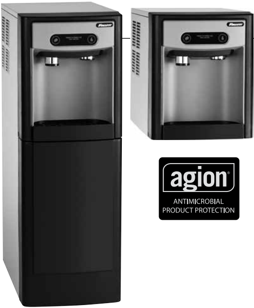
Shown with optional base stand

NOTE: For use in applications with greater than 5 mg/l but less than 400 mg/l total dissolved solids in water and less than 200 mg/l hardness (either naturally occurring or treated with reverse osmosis or other TDS reducing technology).