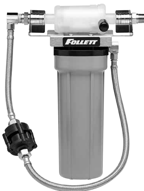
Bacterial-retentive filter system

SafeCLEAN Plus, SensorSAFE, Symphony and Symphony Plus are trademarks of Follett LLC. Follett is a registered trademark of Follett LLC, registered in the US.