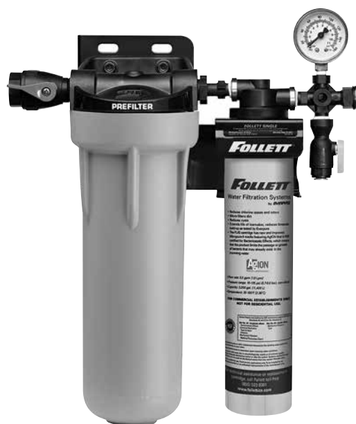
Carbon and carbonless filter