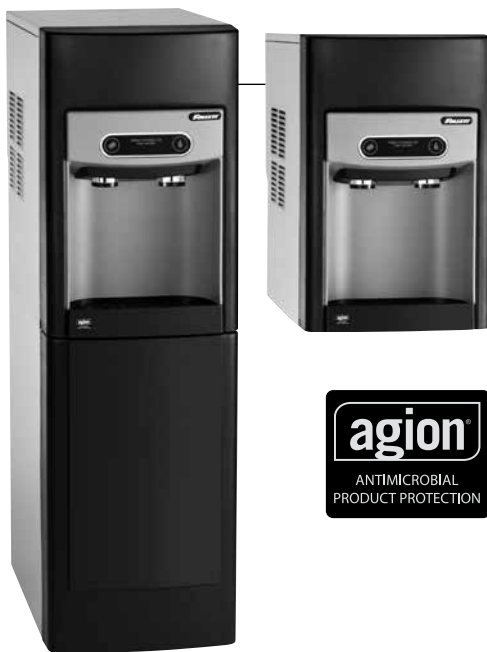
Shown with optional base stand

NOTE: For use in applications with greater than 5 mg/l but less than 400 mg/l total dissolved solids in water and less than 200 mg/l hardness (either naturally occurring or treated with reverse osmosis or other TDS reducing technology). Not recommended for use with softened water.