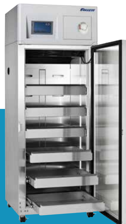
Blood bank refrigerator