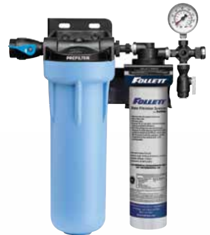
Carbon and carbonless water filter system

Agion is a registered trademark of Sciessent LLC. Horizon Elite, Maestro Plus, Micro Chewblet, SensorSAFE, Symphony Plus and Quiet Night are trademarks of Follett LLC. Chewblet and Follett are registered trademarks of Follett LLC, registered in the US. Follett reserves the right to change specifications at any time without obligation.