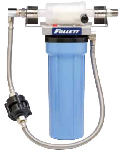
Bacterial-retentive filter system

Follett's industry-first pressurized water sanitizing kits sanitize the internal pressurized water lines of the ice and water dispenser. The procedure facilitates a complete sanitization of the entire ice and water dispenser when performed in conjunction with the standard ice machine and dispenser cleaning/sanitizing process.