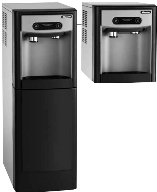
Shown with optional base stand

NOTE: For use in applications with greater than 5 mg/l but less than 400 mg/l total dissolved solids in water and less than 200 mg/l hardness (either naturally occurring or treated with reverse osmosis or other TDS reducing technology).