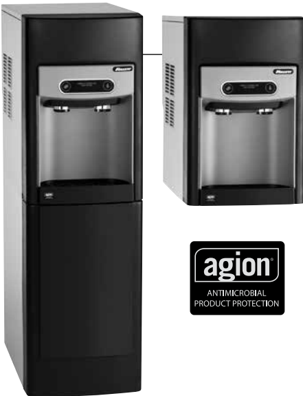
Shown with optional base stand

NOTE: For use in applications with greater than 5 mg/l but less than 400 mg/l total dissolved solids in water and less than 200 mg/l hardness (either naturally occurring or treated with reverse osmosis or other TDS reducing technology). Not recommended for use with softened water.