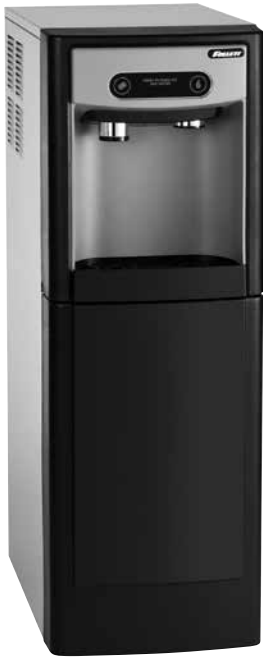
Shown with optional base stand