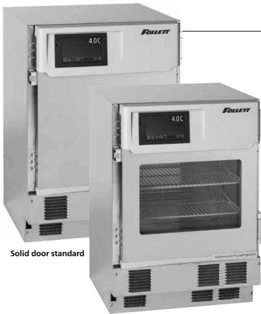
Solid door standard