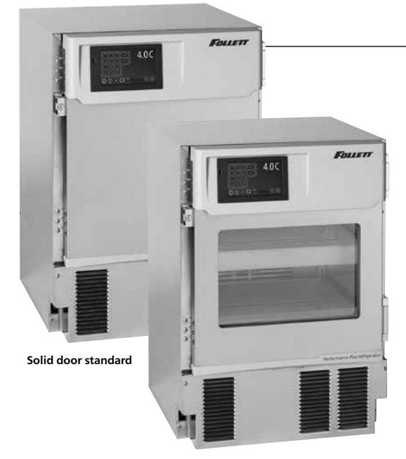
Optional glass door