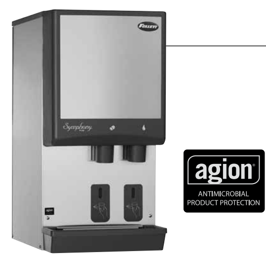
Shown with SensorSAFE™