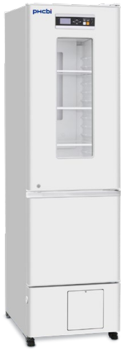
MPR-N250FH-PA | REFFZR9-GS