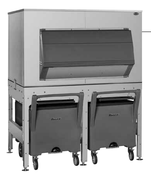
Gravity ice dispense eliminates scooping