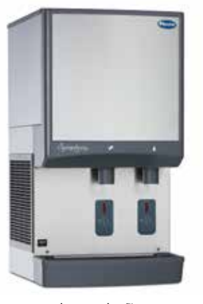
Symphony Plus<sup>™</sup> ice and water dispensers