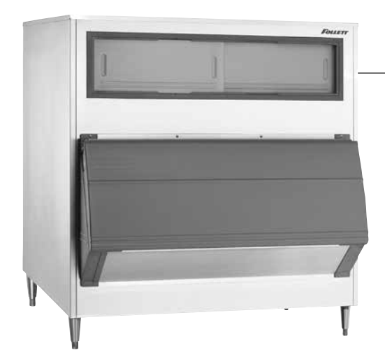
Model E-SG1300-49D shown