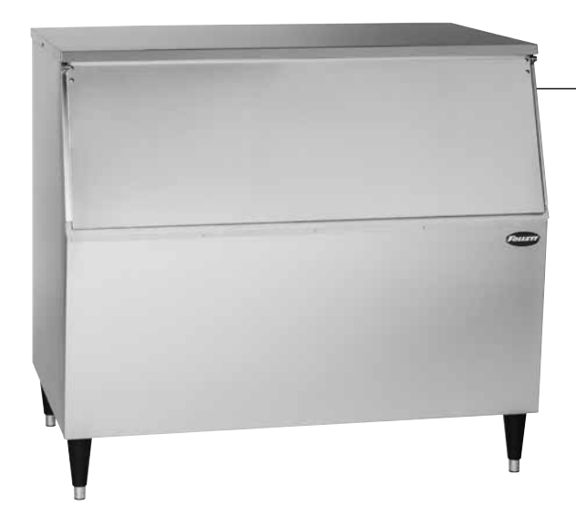
Model E-650-44 shown