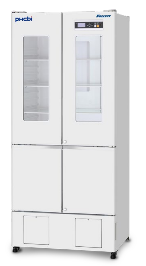
MPR-N450FH-PA | REFFZR16-GS