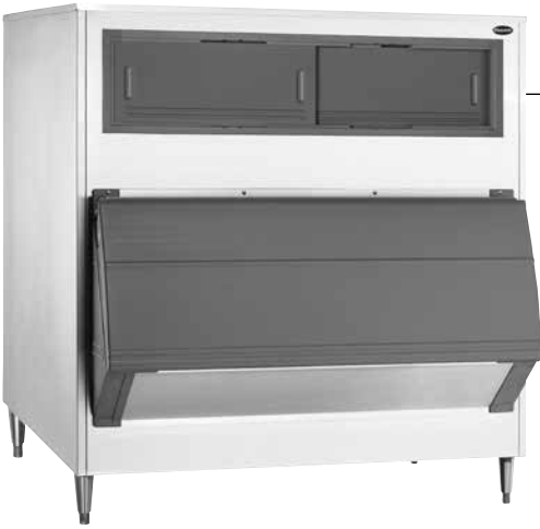
Model SG1010-48 shown